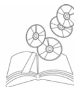
Recordings of Worship Services

Recordings of Sunday services and special events are available through the Audio Ministry. CDs are now be available as well as cassette tapes. To request a copy, sign up on the Audio Ministry Request sign-up sheet, available at the News Table in either lobby. You can also email requests to or call the church office. Every effort will be made to have copies ready on the Sunday after you complete the request. Completed orders will be available for pickup on the table in the Bedford Street lobby. The cost of each copy is a suggested $1 donation. Please use the Tape Ministry envelopes (located on the table in Bedford Street Lobby) to submit donations.