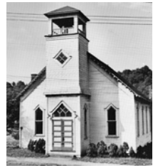
The First Oakland Church Building

"The Church's one foundation is Jesus Christ her Lord."