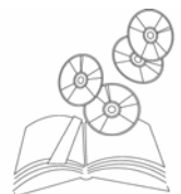
Recordings of Worship Services

CD Recordings of Sunday services and special events are available through the Audio Ministry. To request a copy, sign up on the Audio Ministry Request sign-up sheet, available at the News Table in either lobby. You can also email requests to or call the church office. Every effort will be made to have copies ready on the Sunday after you complete the request. Completed orders will be available for pickup on the table in the Bedford Street lobby. The cost of each copy is a suggested $1 donation. Please use the CD Duplication envelopes (located on the table in Bedford Street Lobby) to submit donations.